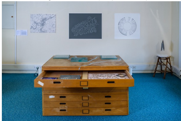
Image below left: Exhibition shot showcasing Ab-Sense installation by Inge Panneels with Ortelius map just in view in the drawer on the right-hand and maps by Alec Finlay on the wall.